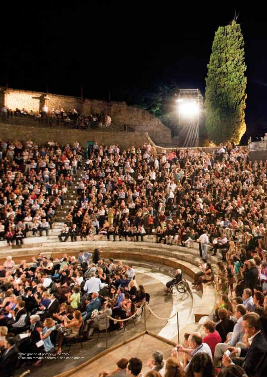
teatro grande of pompeii, june 2010