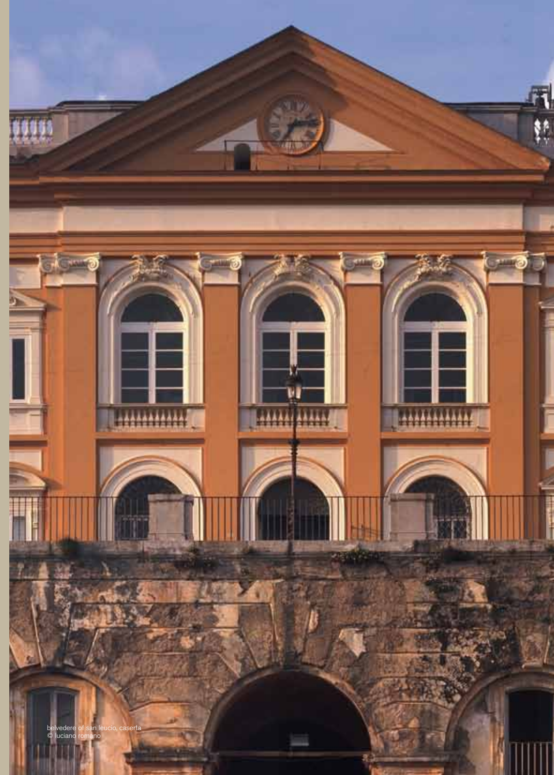
belvedere of san leucio, caserta