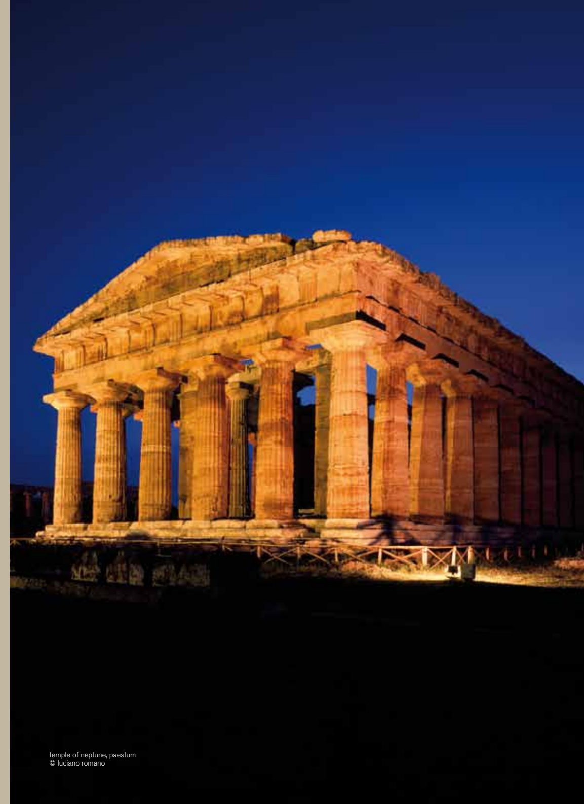
temple of neptune, paestum

Jim Nisbet, Ethan Canin July 29* pompeii theatre area *free entrance